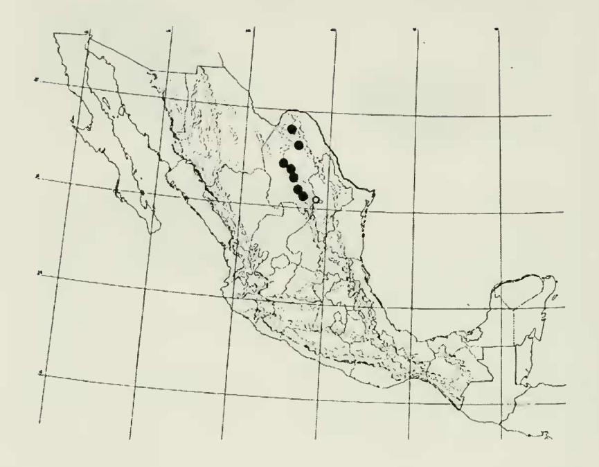
Fig. 2. Distribution of Physaria mexicana (dots), and P. vigana (circle).